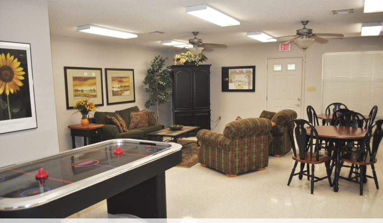
Community Living Room