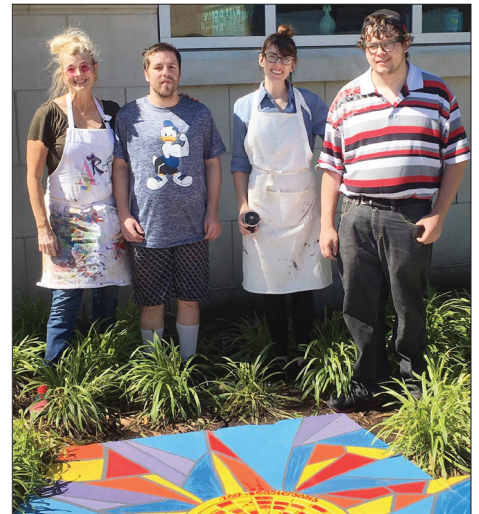
Easterseals adults took 3rd place in the Little Rock Drain Smart contest.